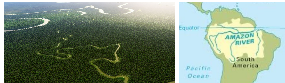
This picture shows a map of the Amazon River in South America.