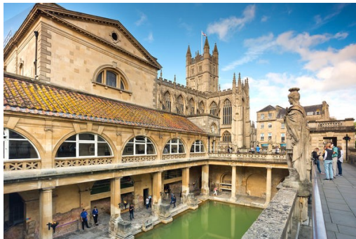
The Roman Baths which still stand in Bath now in the present day.